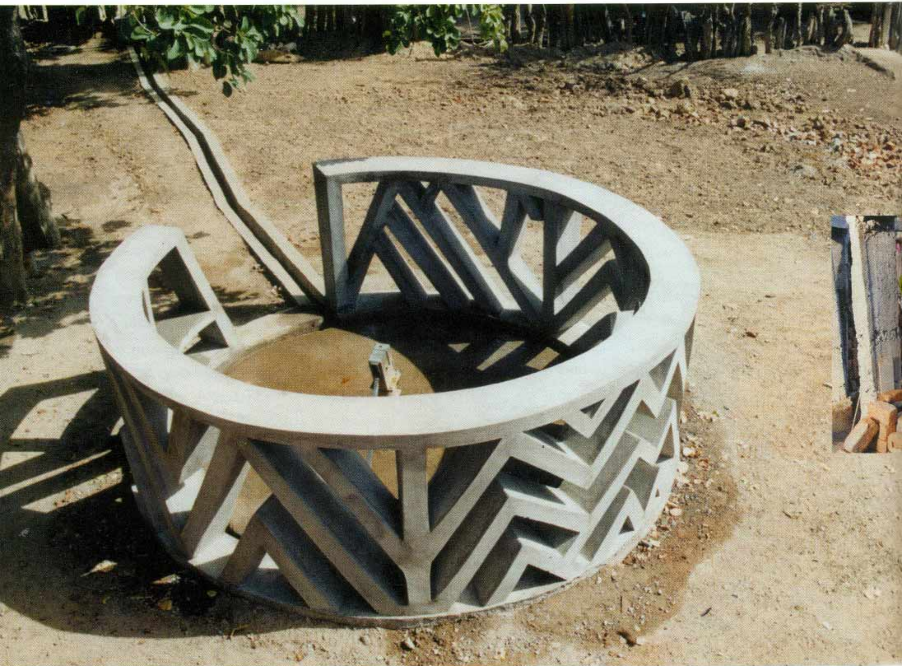
Navjot Altaf, Mumbai, collaborates with wood sculptors Rajkumar, Chessuram and Shantibai and local communities in Bastar to design and create site-oriented works. Photographs on this and facing page: development of a space around a community handpump (Nalpar) in Bandhapara. Photographs on pages 8 and 9: a Nalpar developed in Kondagaon