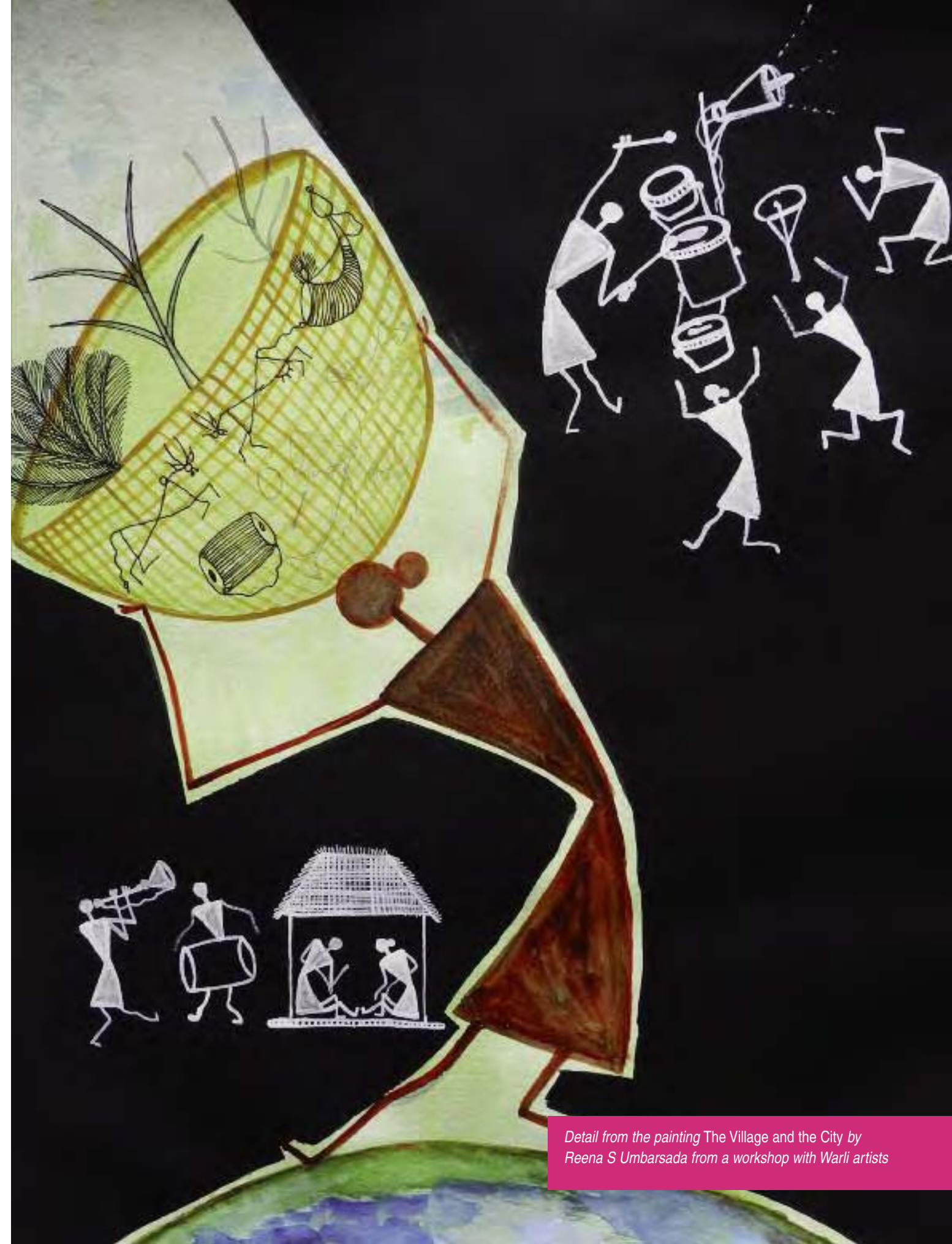
Detail from the painting The Village and the City by Reena S Umbarasada from a workshop with Warli artists