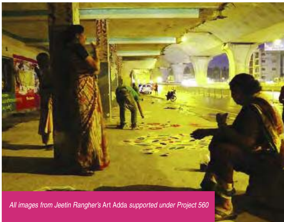
All images from Jeetin Rangher's Art Adda supported under Project 560