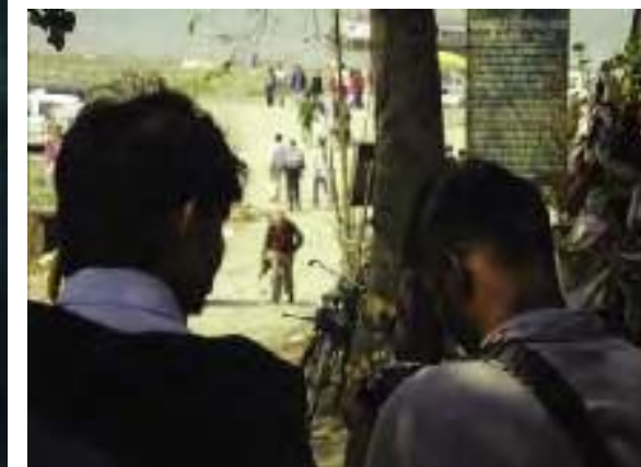
Participants visiting Uzan Bazar Ghat for scouting and shooting from Workshop One curated by Desire Machine Collective