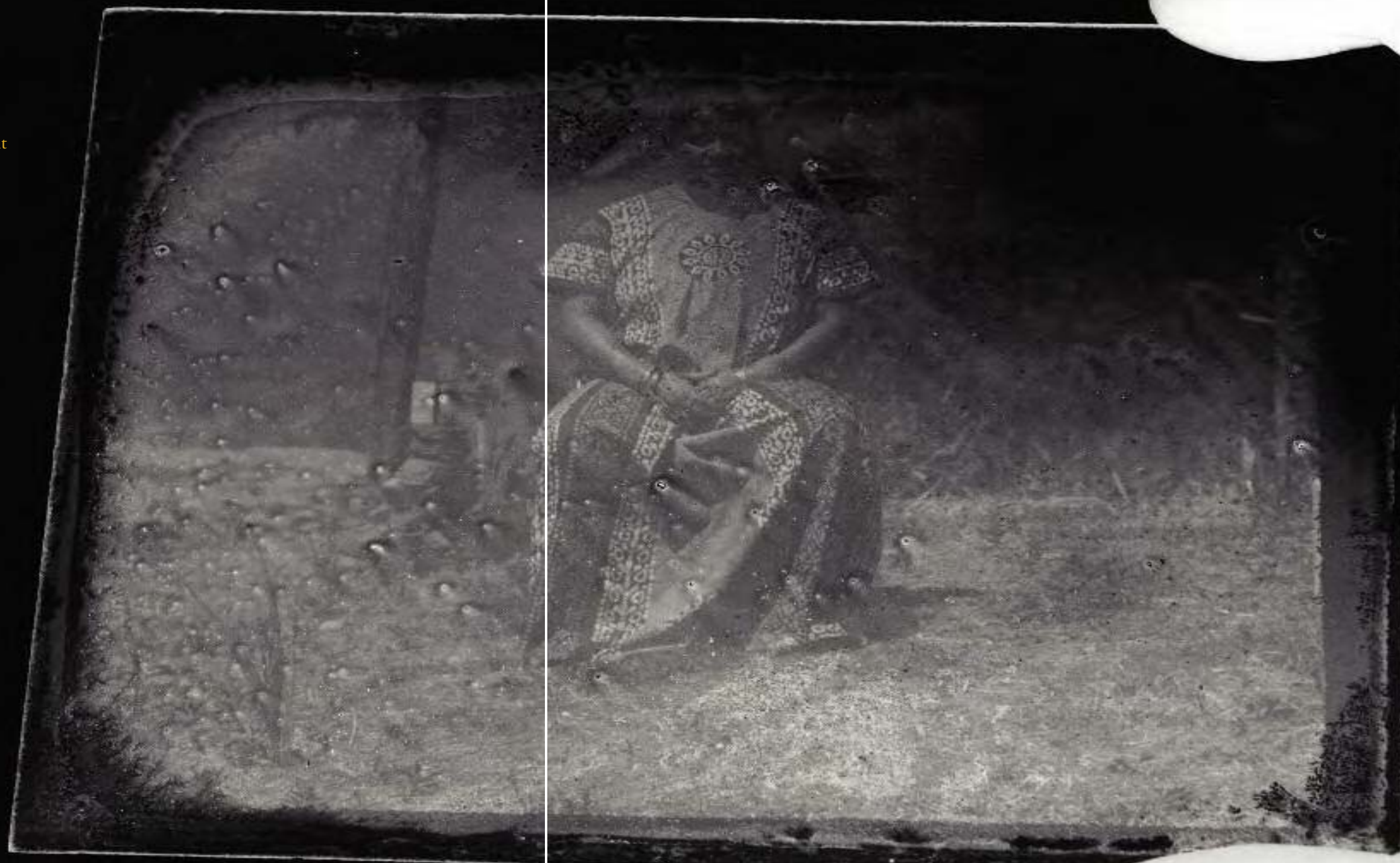
Dry plate negative on glass taken during an alternative photography project by Tushar Joshi and K Balamurugan