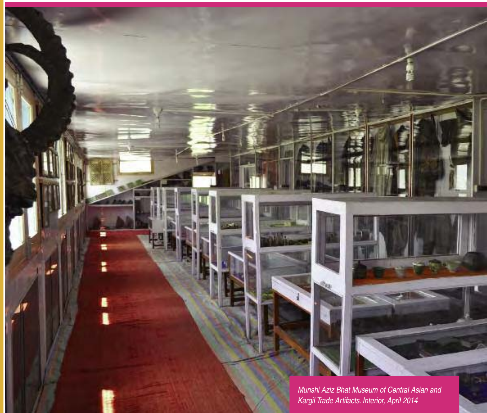
Munshi Aziz Bhat Museum of Central Asian and Kargil Trade Artifacts. Interior, April 2014

“A new effort (at IFA) has been made to provide fellowships which allow recipients to work closely with, and learn from, existing museums and archives, in their creative productions. This will go a long way in encouraging young artists and others interested in challenging the more passive and conventional relationships to archives and museums, to great mutual benefit.”