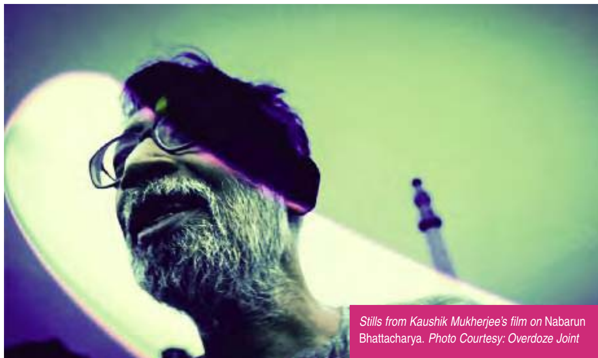
Stills from Kaushik Mukherjee's film on Nabarun Bhattacharya.