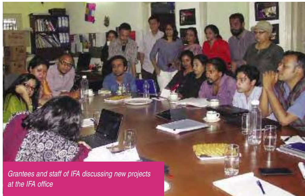
Grantees and staff of IFA discussing new projects at the IFA office