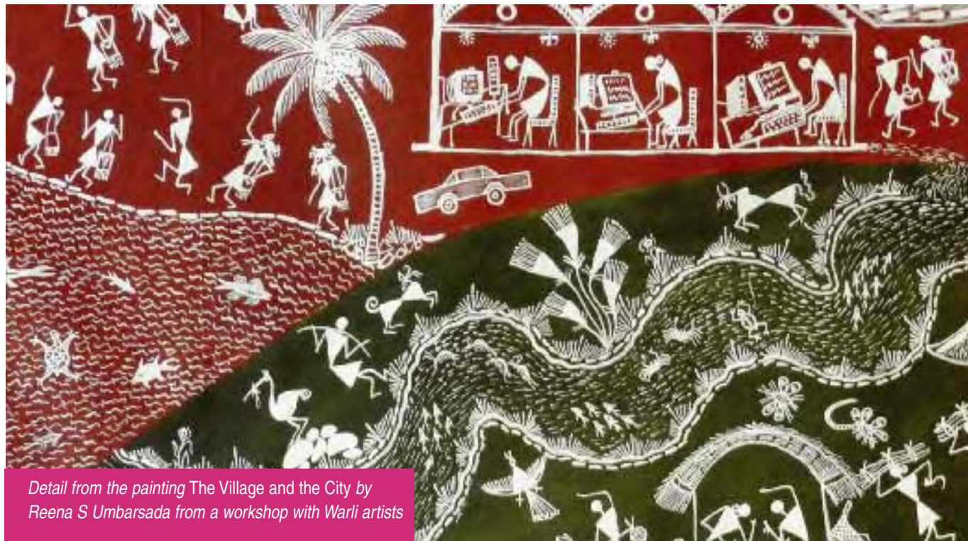
Detail from the painting The Village and the City by Reena S Umbarada from a workshop with Warli artists