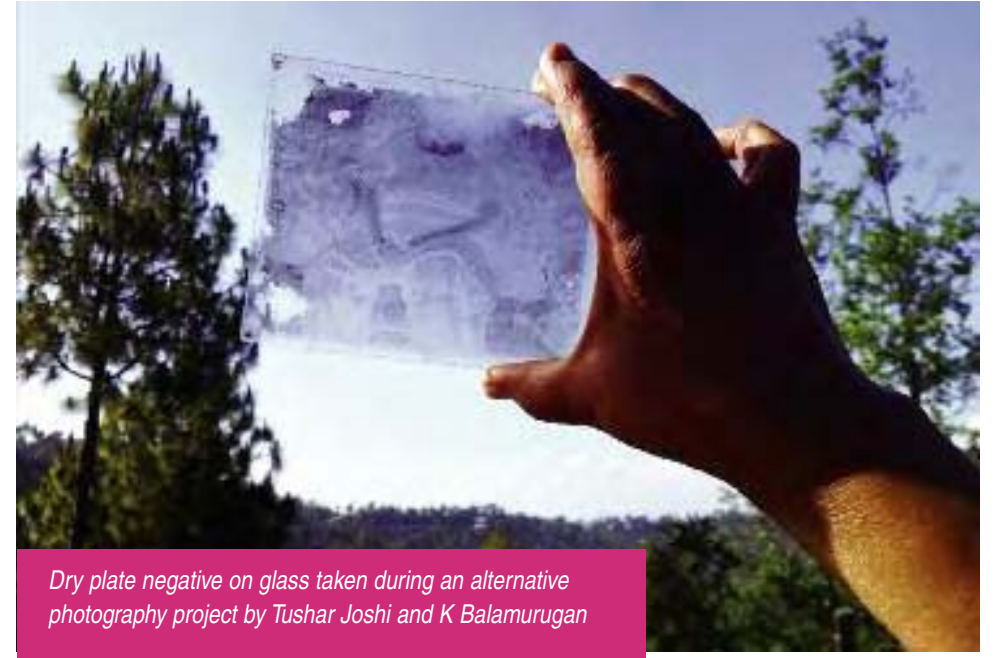
Dry plate negative on glass taken during an alternative photography project by Tushar Joshi and K Balamurugan