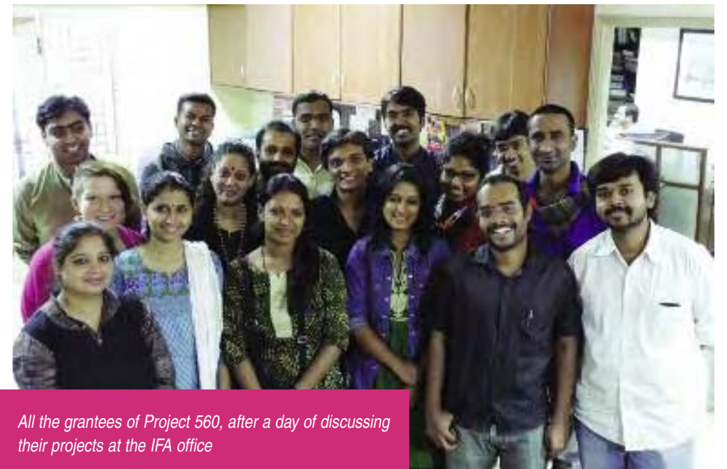
All the grantees of Project 560, after a day of discussing their projects at the IFA office