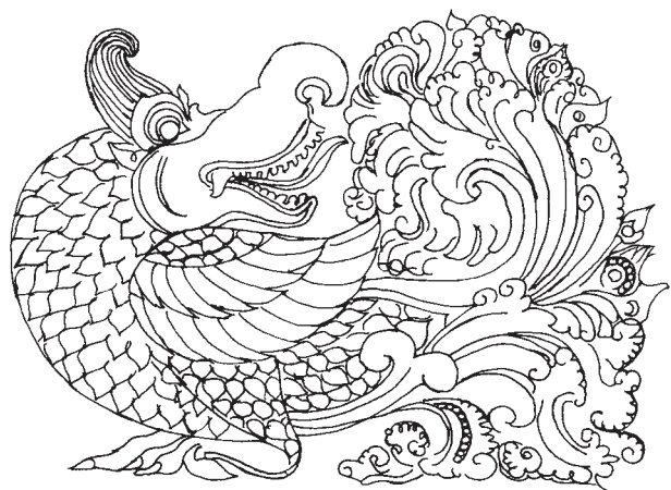
This and facing page: T. Pankajaksha's line drawings which form part of his documentation of traditions of sculpture in south India. See also pages 4-5 and 28-32.