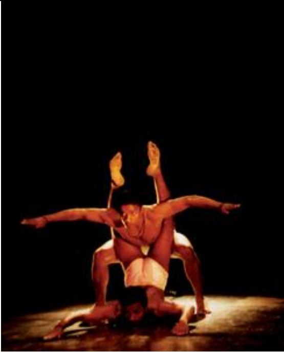
Still from an Adishakti performance