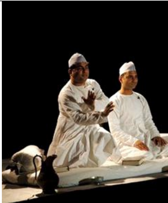
A Dastangoi performance

Our recent grants have gone out under four programmes. Under arts education, we have made a grant for a series of theatre and puppetry workshops in and around Karnataka's Dharwad district so as to strengthen theatre arts pedagogy at the school and college levels. Support has also gone out for residencies for fresh graduates of art schools